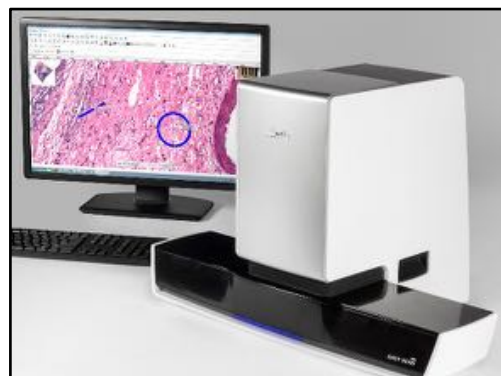
Automatic Slide Scanner