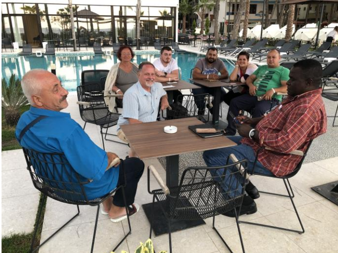
In Durres, Albania, with ministry partners from North Macedonia.

As I've mentioned in the past, travel for my ministry with NAB Gateway has been non-existent for the better part of 2020 and 2021. That all changed in a big way over these past two months as I've been able to get back out 'on the road again.' But it hasn't been easy; COVID protocols are different depending on the country, and you have to be vigilant in keeping yourself updated on the latest testing, vaccination, and masking requirements on airlines and out in the general public. But despite all of these challenges, I can tell you that to date I'm six for six in negative COVID tests! (Never thought I'd be 'proud' of something like that!)