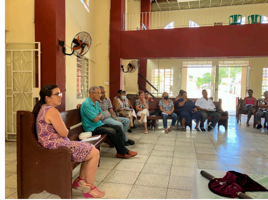
SCP orientation at Iglesia La Jordan

1219 PLEASANT GROVE BLVD., ROSEVILLE, CA, 95678 RSCHMOR@NABCONF.ORG | SERVE@NABCONF.ORG WWW.NABCONFERENCE.ORG